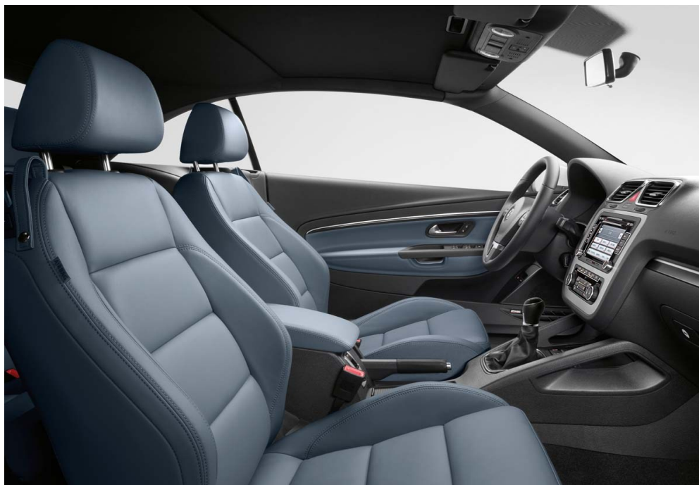
Atlantic Blue Leather*